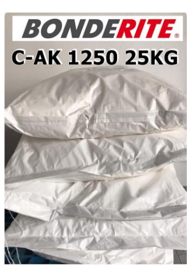
BONDERITE C-AK 1250