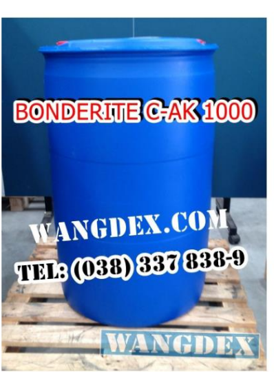
BONDERITE C-AK 1000